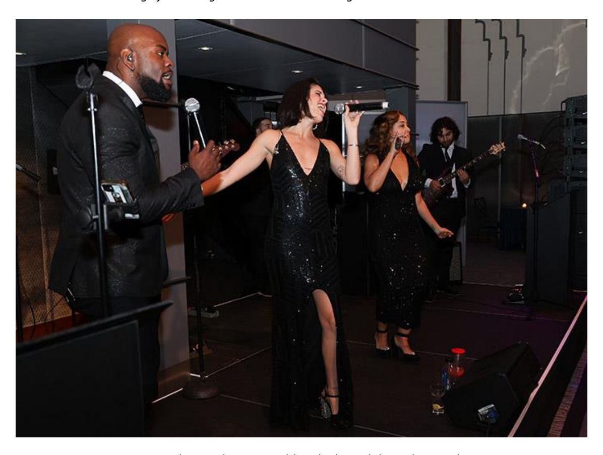
Attendees at the VNS Health Gala danced the night away!