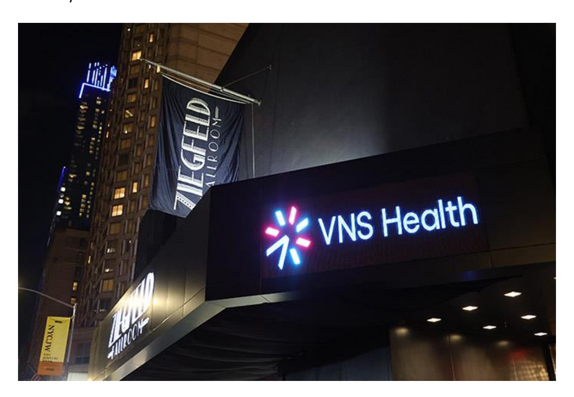
The 2023 benefit theme was "Empowering Our Neighbors in Need."

The VNS Health Annual Benefit celebrated the dedicated public health heroes who bring care to New York's most vulnerable people—in the homes and communities where they live. The benefit theme, "Empowering Our Neighbors in Need," evoked the spirit of resiliency and hope inherent in the organization's focus. The event raised over $1 million, which will support the nonprofit's community impact and charitable care programs that help make health care accessible to more than 49,000 New Yorkers on any given day. This year marks 130 years since VNS Health started serving the NY community!