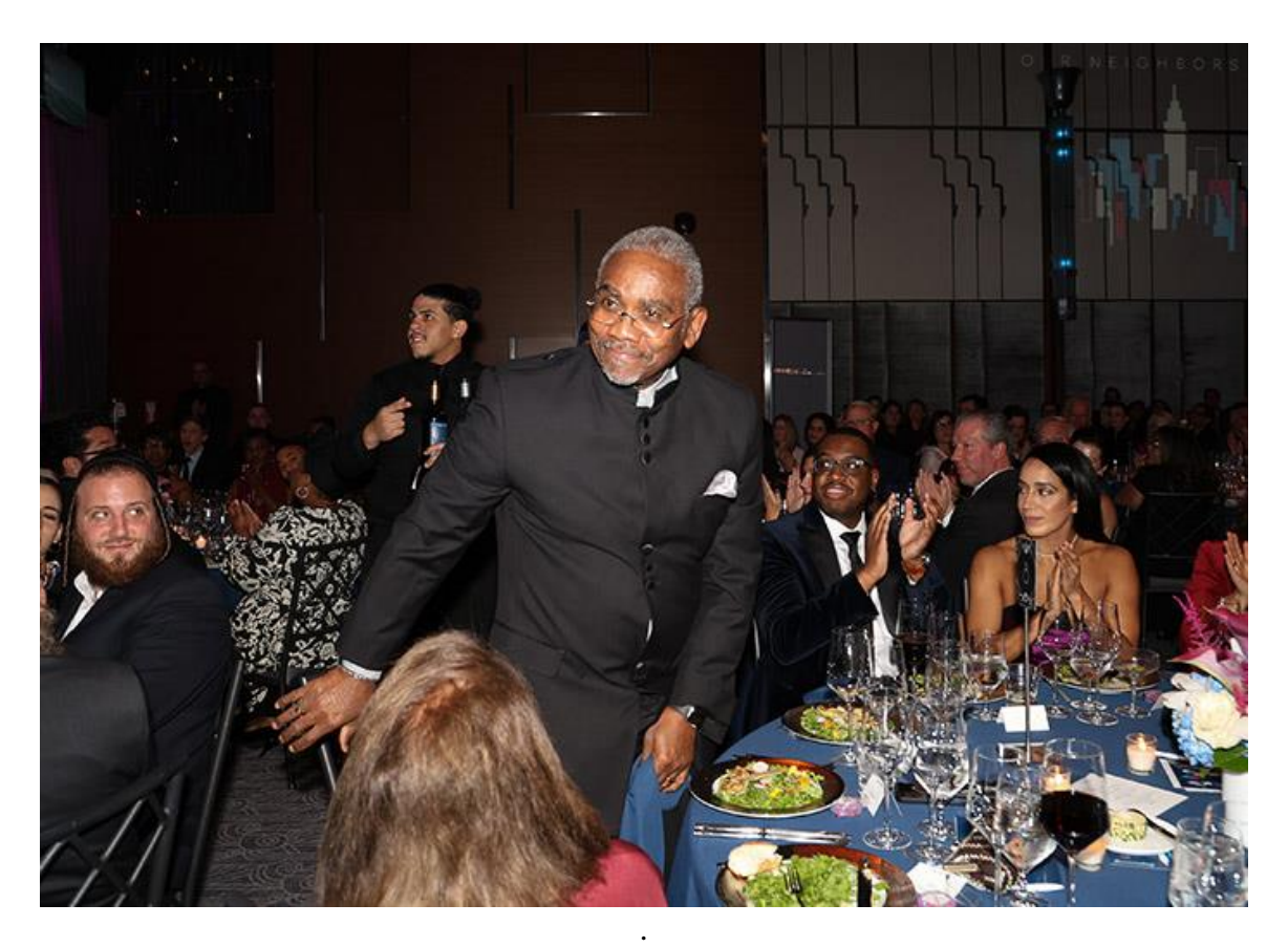
Congressman Gregory Meeks.