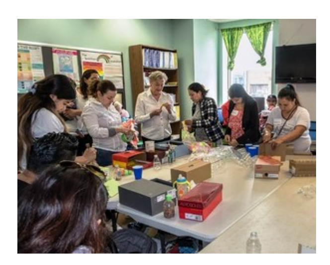
NYC NFP clients enjoy a LEAP workshop learning how to make educational toys from common household items.

from Friends of New York City Nurse-Family Partnership ("the Friends"), who also lead their own programs for NYC NFP moms. Known as the Learn, Eat and Play (or LEAP) program, the sessions have a rotating set of topics, ranging from reading to your baby to choosing the right doctor for your needs to infant massage, and also include crafts and baby play time. In 2018 the group conducted 18 LEAP sessions, serving over 100 mothers.