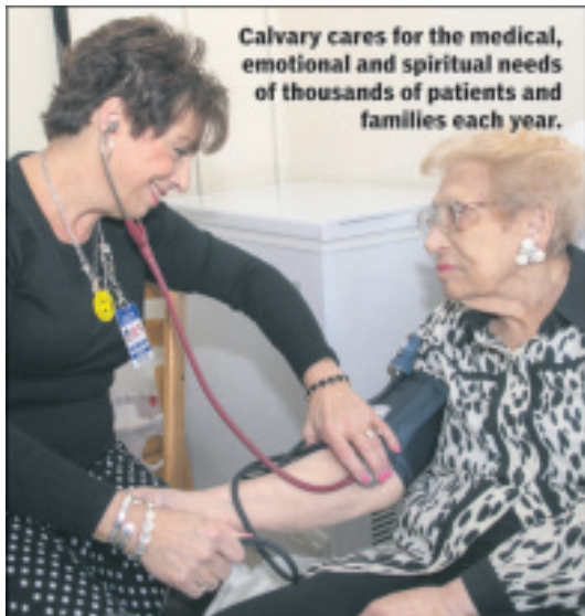
Calvary cares for the medical, emotional and spiritual needs of thousands of patients and families each year.

CalvaryCare is made possible by the generosity of our supporters. To learn more or support our mission, visit www.calvaryhospital.org , call (718) 518-2300 (Inpatient) or call (718) 518-2465 (Calvary@Home). Stay in touch with us on Facebook, LinkedIn and Instagram (calvarycare).